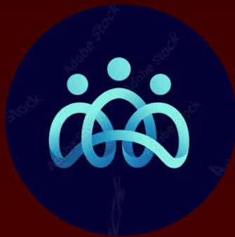
Team members Everyone in the community, starting with the NFT holders